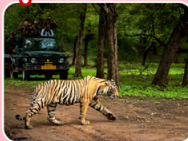
RANTHAMBORE NATIONAL PARK